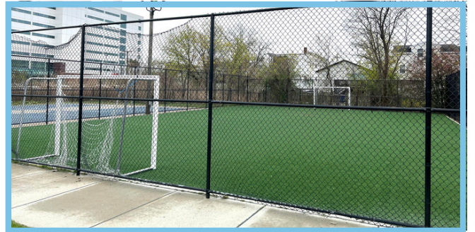
Oak Island Turf: Dashwood Street