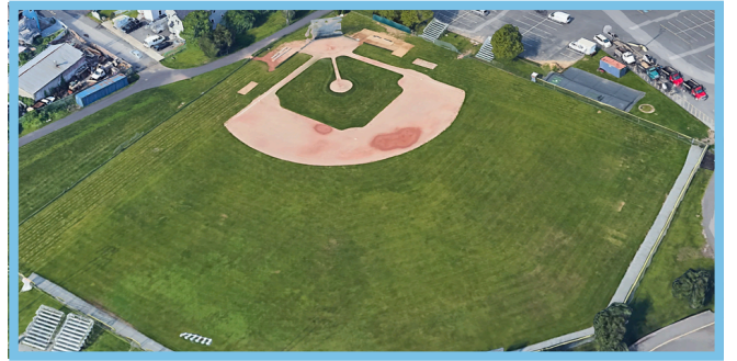
Revere High School Baseball Field: 101 School Street