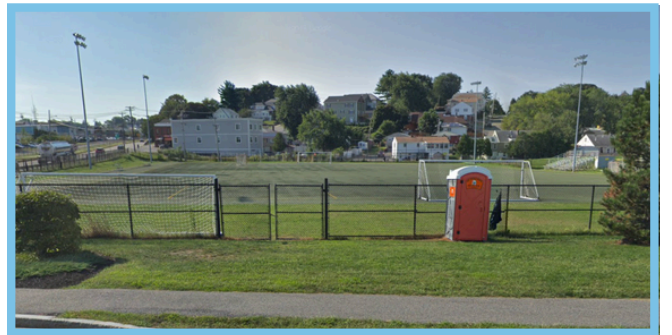
Revere High School Turf: 140 American Legion Hwy