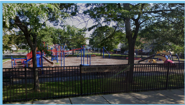
Louis Pasteur Park: 24 Leverett Ave