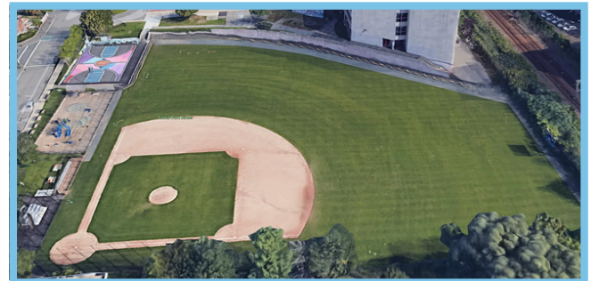
Garfield Baseball Field: 186 Garfield Ave