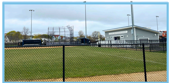
Griswold Field: 671 Washington Ave