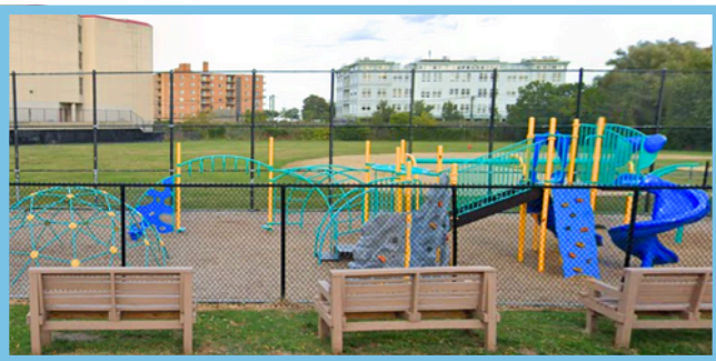
Curtis Park: 176 Garfield Ave