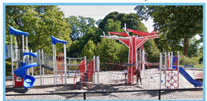
Harmon Park: Salem Street