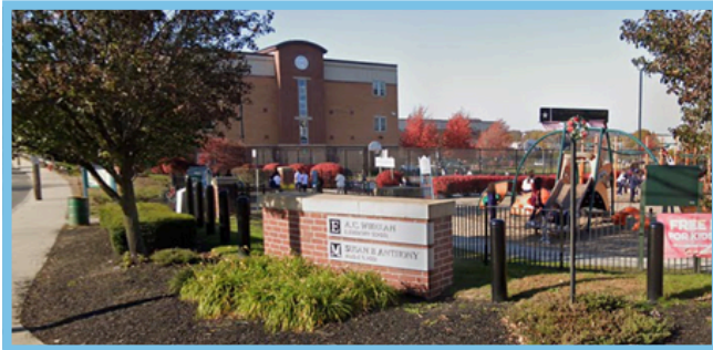
Ciarlone Tot Lot: 107 Newhall Street