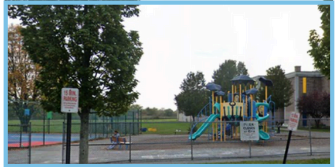
Frederick's Park: 15 Everard Street