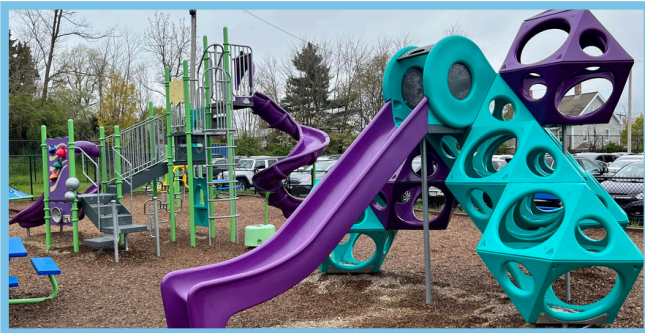
Lincoln School Playground: 68 Tuckerman Street