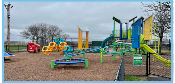
Gibson Park: 36 Hayes Ave