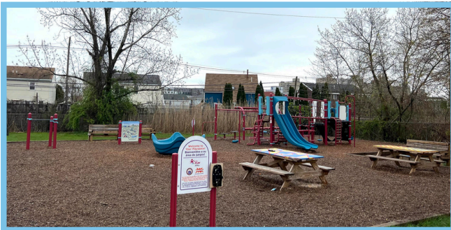
Lighthouse Tot Lot: 395 Revere Street