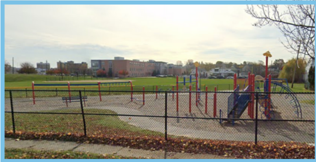
Ambrose Park: Ambrose Street