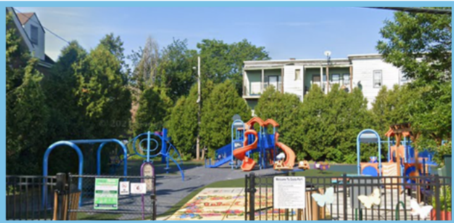
Costa Park: Shirley Ave