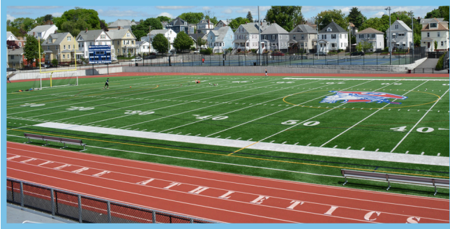
Harry Della Russo Stadium: Park Ave